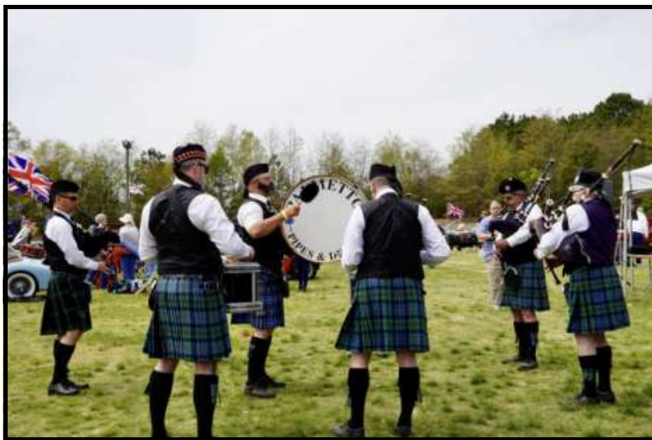
Left: These are Southern Scotsmen. They are from Cayce, SC