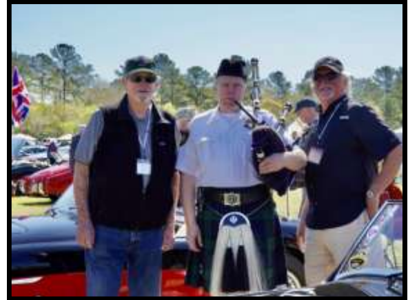
Above: One Scotsman and two wannabees