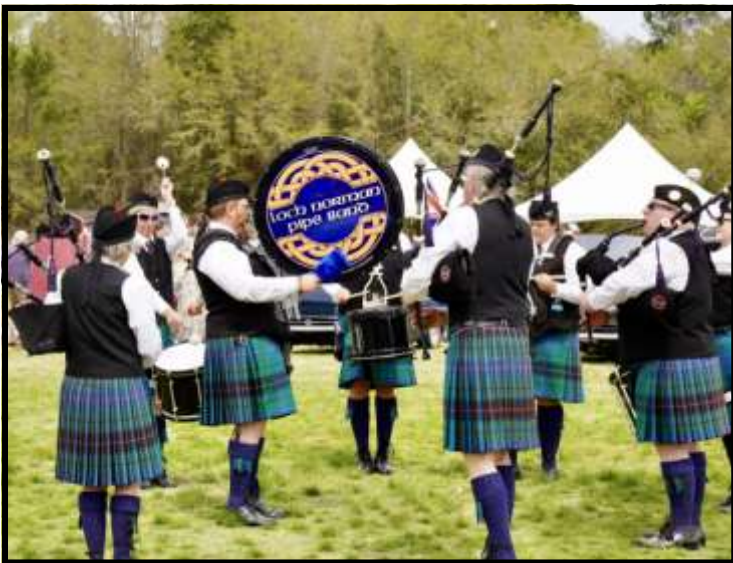
These are Northern Scotsmen. They are from Huntersville, NC

I am told that we had 23 club members present, 14 cars and won a total of 10 awards including 1st through 3rd sweep in the big Healey class, 1st and 2nd in the MGC class and 1st in the MGA class. The skies were Carolina blue and the temperature was mild. The show boasted over 160 cars on the field and more Sunbeams than you would see anywhere including England.