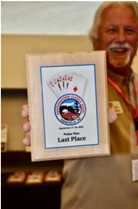
Left: I believe it was five totally unrelated numbers.