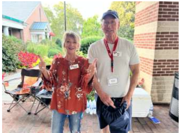
We had outside greeters as well as inside greeters